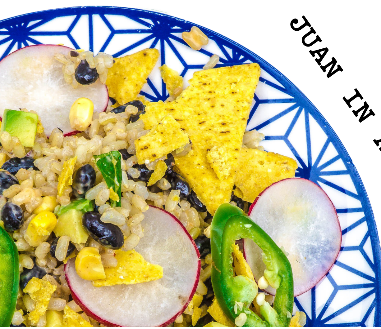
JUAN IN A MILLION

PLEASE CHECK OUR DISPLAY FOR OUR DAILY CHANGING SALADS & SIDES